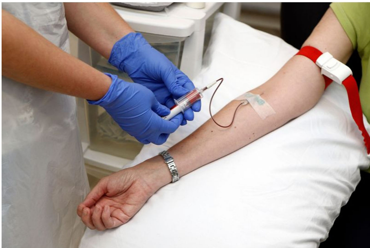
The new blood test can help diagnose Alzheimer's years before symptoms start

The “novel approach” distinguishes between toxic and healthy forms of a protein that clumps in dementia patients